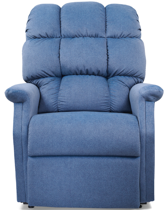
Shown in Calypso