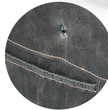
Convenient built-in USB charging port for your phone or tablet located on the outside arm.

Designed and engineered in Old Forge, PA. Assembled in China using Golden components.