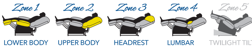
LOWER BODY UPPER BODY HEADREST LUMBAR TWILIGHT TILT

Comfort Zones 1 - 4 provide an ergonomic comfort experience with an emphasis on head and back support. Each Comfort Zone can be adjusted independently by using the exclusive AutoDrive hand control.